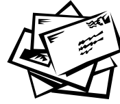
Get Off Junk Mail Lists

Recycle with office paper. Shred first, if concerned about account numbers. To get off junk mail lists, contact Mail Preference Service, Direct Marketing Association, PO Box 643, Carmel, NY 15012-0643